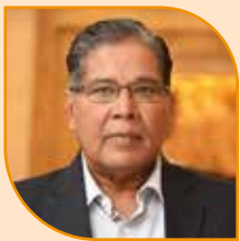
Dr. K. Rahman Khan Former Union Minister of Minority Affairs and Ex-Deputy Speaker Rajya Sabha