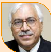
Dr. S. Y. Quraishi Former Chief Election Commissioner of India