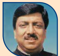
Mr. Shahid Siddiqui Former MP Editor, Nai Duniya